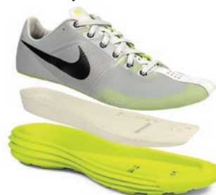
Foam encased in Phylon