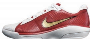
Nike Zoom Court Luna